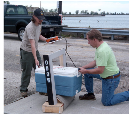
Scanning your catch