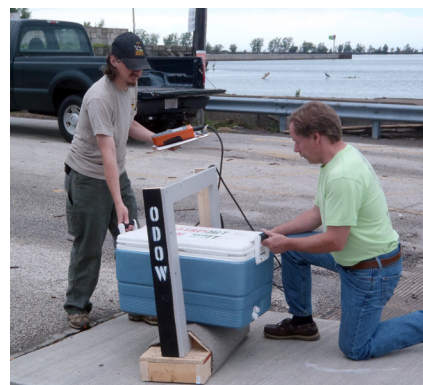
Scanning your catch